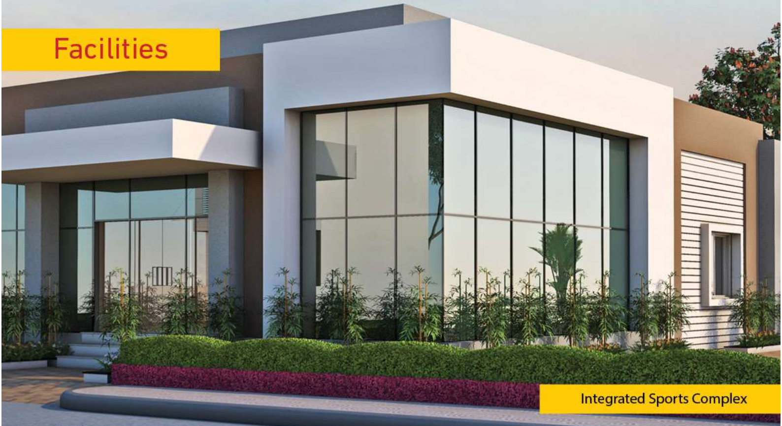
Integrated Sports Complex