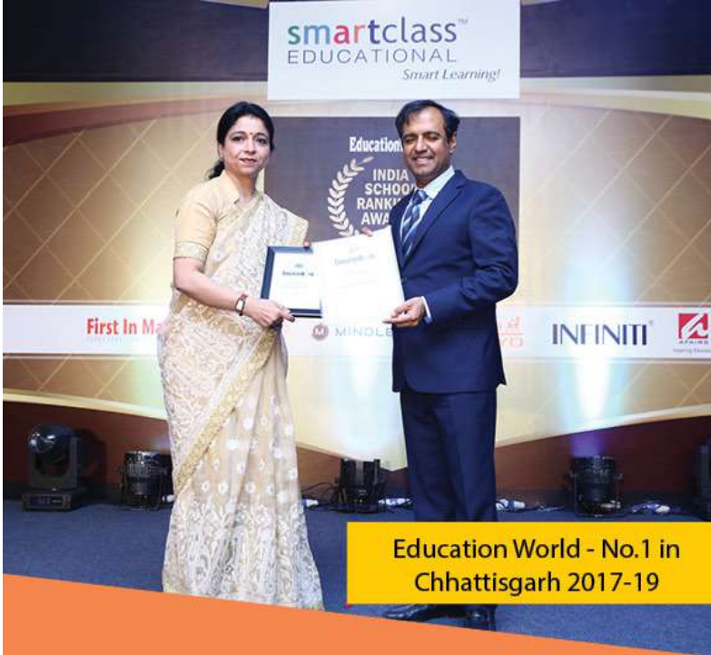
Education World - No.1 in Chhattisgarh 2017-19