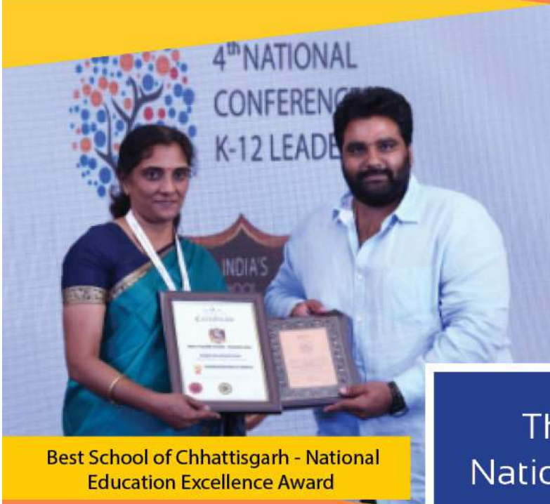
Best School of Chhattisgarh - National Education Excellence Award