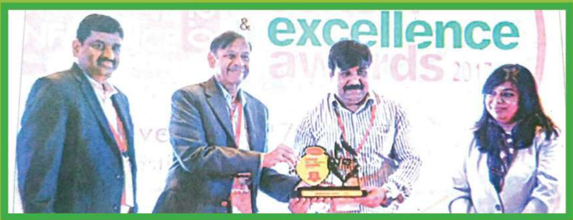
Best School in Chhattisgarh at the Brain Feed School Excellence Awards