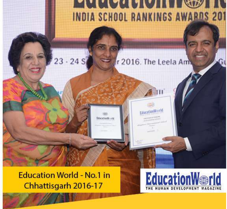
Education World - No.1 in Chhattisgarh 2016-17