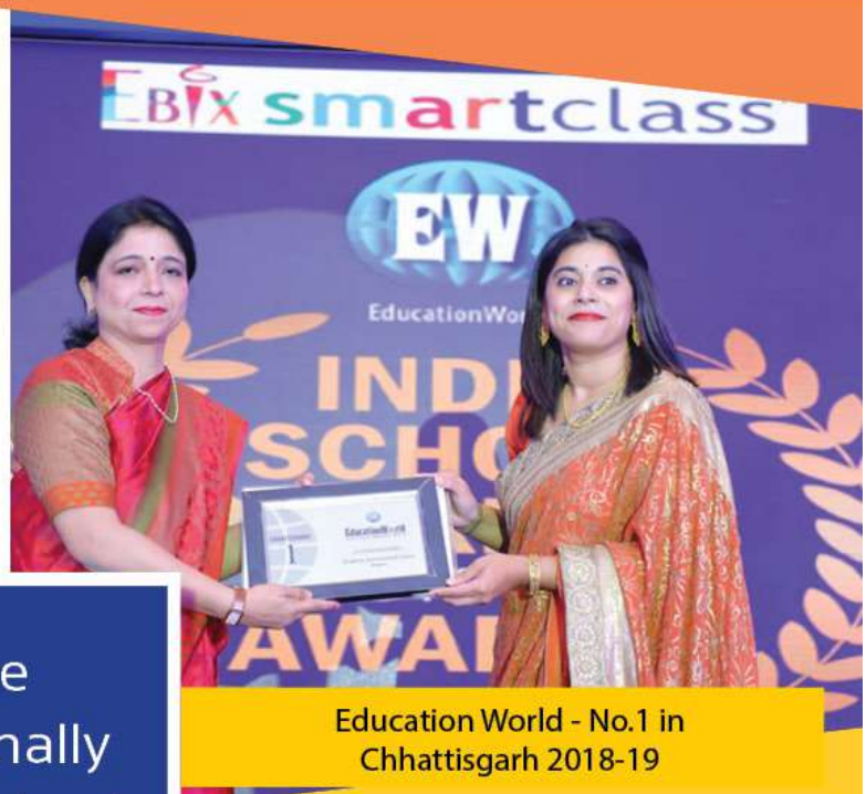
Education World - No.1 in Chhattisgarh 2018-19